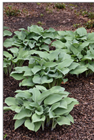
Krossa Regal Hosta