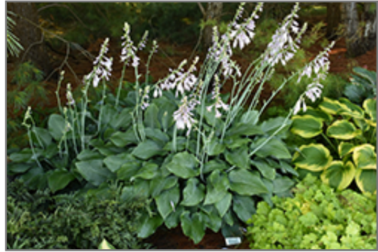
Krossa Regal Hosta in bloom

This plant does best in partial shade to shade. It prefers to grow in average to moist conditions, and shouldn't be allowed to dry out. It is not particular as to soil type or pH. It is somewhat tolerant of urban pollution. This particular variety is an interspecific hybrid. It can be propagated by division; however, as a cultivated variety, be aware that it may be subject to certain restrictions or prohibitions on propagation.