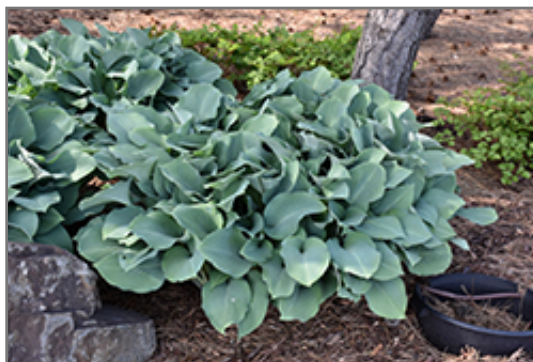
Krossa Regal Hosta