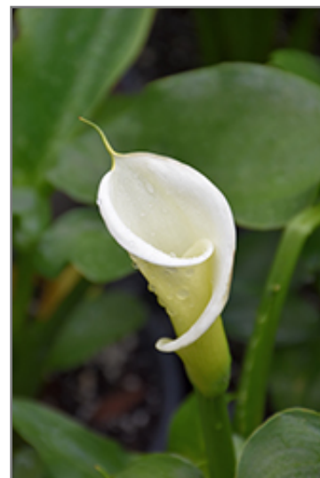
Large White Calla Lily flowers

This variety forms a sturdy mound of leathery, shiny green arrow shaped leaves, bearing stems of white, funnel shaped flowers with a yellow spadix; a classic at weddings; an outstanding indoor accent plant