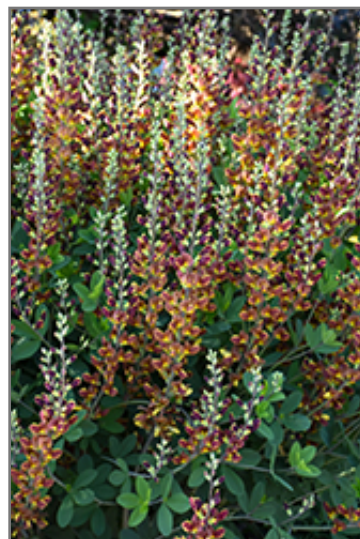
Decadence Cherries Jubilee False Indigo flowers

Decadence Cherries Jubilee False Indigo is a fine choice for the garden, but it is also a good selection for planting in outdoor pots and containers. With its upright habit of growth, it is best suited for use as a 'thriller' in the 'spiller-thriller-filler' container combination; plant it near the center of the pot, surrounded by smaller plants and those that spill over the edges. It is even sizeable enough that it can be grown alone in a suitable container. Note that when growing plants in outdoor containers and baskets, they may require more frequent waterings than they would in the yard or garden.