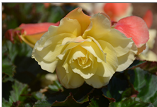
Fragrant Falls Lemon Begonia flowers

Fragrant Falls Lemon Begonia is an herbaceous annual with a trailing habit of growth, eventually spilling over the edges of hanging baskets and containers. Its medium texture blends into the garden, but can always be balanced by a couple of finer or coarser plants for an effective composition.