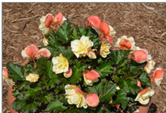
Fragrant Falls Lemon Begonia in bloom

Fragrant Falls Lemon Begonia is a fine choice for the garden, but it is also a good selection for planting in outdoor containers and hanging baskets. Because of its trailing habit of growth, it is ideally suited for use as a 'spiller' in the 'spiller-thriller-filler' container combination; plant it near the edges where it can spill gracefully over the pot. Note that when growing plants in outdoor containers and baskets, they may require more frequent waterings than they would in the yard or garden.