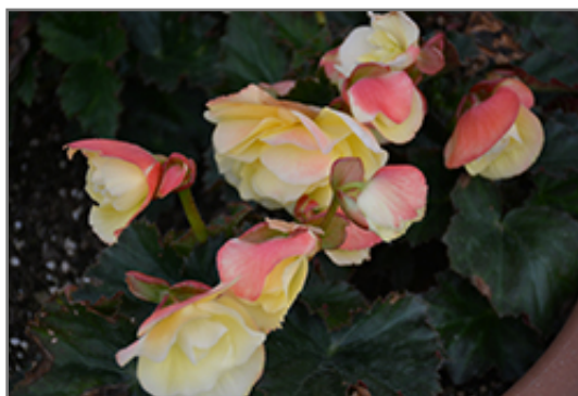
Fragrant Falls Lemon Begonia flowers