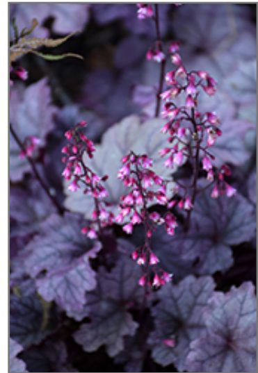
Pink Panther Coral Bells flowers

Pink Panther Coral Bells is a fine choice for the garden, but it is also a good selection for planting in outdoor pots and containers. With its upright habit of growth, it is best suited for use as a 'thriller' in the 'spiller-thriller-filler' container combination; plant it near the center of the pot, surrounded by smaller plants and those that spill over the edges. Note that when growing plants in outdoor containers and baskets, they may require more frequent waterings than they would in the yard or garden.