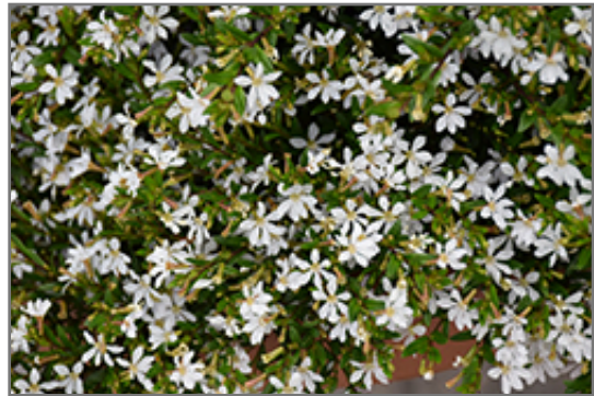
FloriGlory Maria Mexican Heather flowers

This is a multi-stemmed evergreen houseplant with an upright spreading habit of growth. Its relatively fine texture sets it apart from other indoor plants with less refined foliage. This plant may benefit from an occasional pruning to look its best.