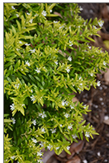
FloriGlory Maria Mexican Heather flowers