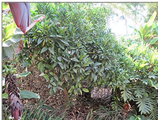
Cara Cara Navel Orange

When grown indoors, Cara Cara Navel Orange can be expected to grow to be about 7 feet tall at maturity, with a spread of 6 feet. It grows at a medium rate, and under ideal conditions can be expected to live for approximately 50 years. This houseplant will do well in a location that gets either direct or indirect sunlight, although it will usually require a more brightly-lit environment than what artificial indoor lighting alone can provide. It does best in average to evenly moist soil, but will not tolerate standing water. The surface of the soil shouldn't be allowed to dry out completely, and so you should expect to water this plant once and possibly even twice each week. Be aware that your particular watering schedule may vary depending on its location in the room, the pot size, plant size and other conditions; if in doubt, ask one of our experts in the store for advice. It is not particular as to soil type or pH; an average potting soil should work just fine.