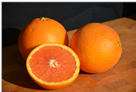
Cara Cara Navel Orange fruit and flesh

This is a multi-stemmed evergreen houseplant with an upright spreading habit of growth. This plant may benefit from an occasional pruning to look its best.