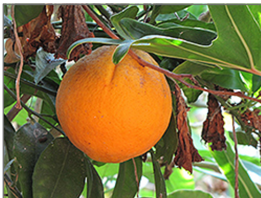
Cara Cara Navel Orange fruit