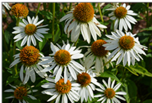
Happy Star Coneflower flowers

Happy Star Coneflower is recommended for the following landscape applications;