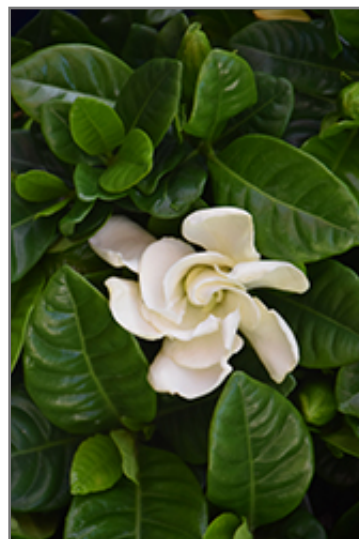
Four Seasons Gardenia flowers

When grown indoors, Four Seasons Gardenia can be expected to grow to be about 4 feet tall at maturity, with a spread of 4 feet. It grows at a slow rate, and under ideal conditions can be expected to live for approximately 30 years. This houseplant will do well in a location that gets either direct or indirect sunlight, although it will usually require a more brightly-lit environment than what artificial indoor lighting alone can provide. It does best in average to evenly moist soil, but will not tolerate standing water. The surface of the soil shouldn't be allowed to dry out completely, and so you should expect to water this plant once and possibly even twice each week. Be aware that your particular watering schedule may vary depending on its location in the room, the pot size, plant size and other conditions; if in doubt, ask one of our experts in the store for advice. It is very fussy about its soil conditions and must be grown in rich, acidic soil to ensure success. Contact the store for specific recommendations on pre-mixed potting soil for this plant.