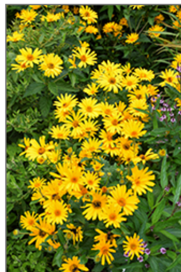
Prima Ballerina False Sunflower flowers