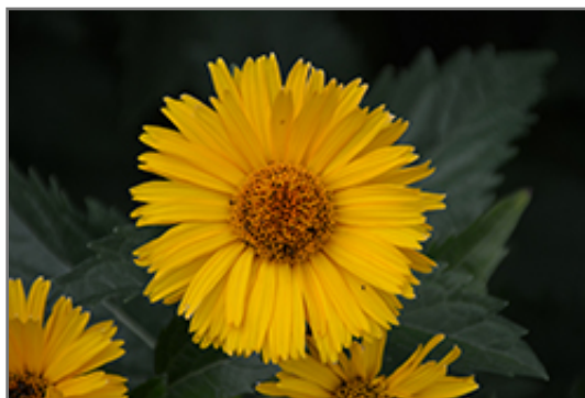
Prima Ballerina False Sunflower flowers

Prima Ballerina False Sunflower is recommended for the following landscape applications;