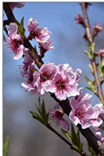
White Lady Peach flowers