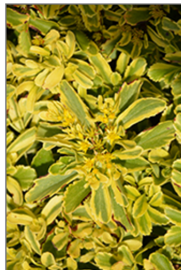
Cutting Edge Stonecrop flowers

Cutting Edge Stonecrop is recommended for the following landscape applications;