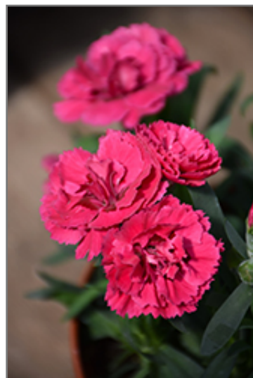
Oscar Cherry and Velvet Carnation flowers