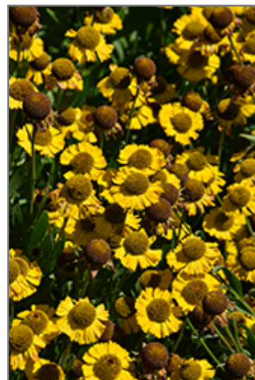
Salud Golden Sneezeweed flowers