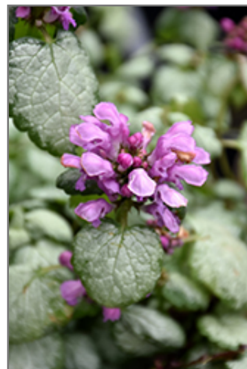
Red Nancy Spotted Dead Nettle flowers