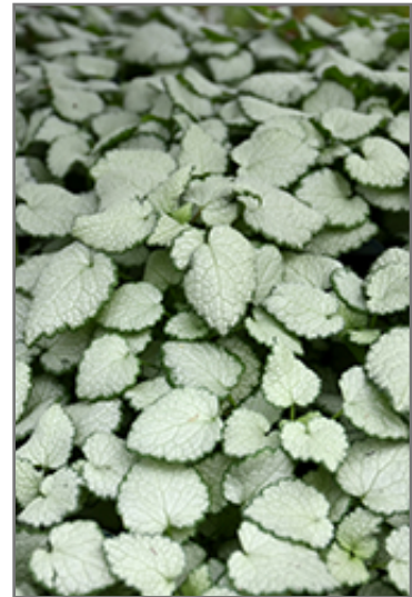
Red Nancy Spotted Dead Nettle foliage

Red Nancy Spotted Dead Nettle is a fine choice for the garden, but it is also a good selection for planting in outdoor pots and containers. Because of its spreading habit of growth, it is ideally suited for use as a 'spiller' in the 'spiller-thriller-filler' container combination; plant it near the edges where it can spill gracefully over the pot. Note that when growing plants in outdoor containers and baskets, they may require more frequent waterings than they would in the yard or garden.