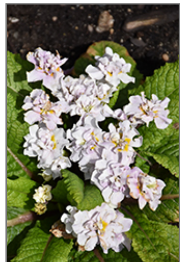
BELARINA PINK ICE Primrose flowers