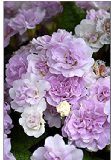
BELARINA PINK ICE Primrose flowers

BELARINA PINK ICE Primrose is recommended for the following landscape applications;