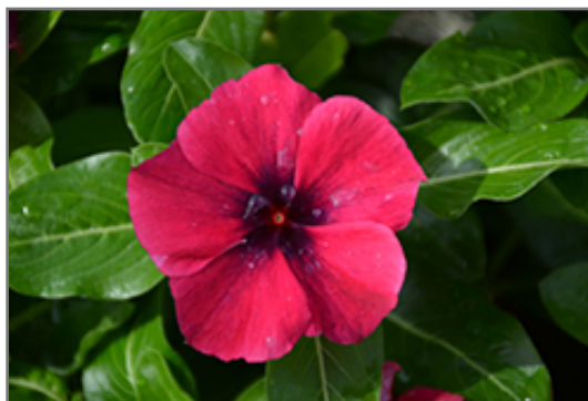
Tattoo Black Cherry Vinca flowers

This plant will require occasional maintenance and upkeep, and should not require much pruning, except when necessary, such as to remove dieback. It is a good choice for attracting butterflies to your yard, but is not particularly attractive to deer who tend to leave it alone in favor of tastier treats. It has no significant negative characteristics.