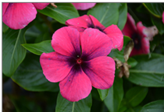
Tattoo Raspberry Vinca flowers

This plant will require occasional maintenance and upkeep, and should not require much pruning, except when necessary, such as to remove dieback. It is a good choice for attracting butterflies to your yard, but is not particularly attractive to deer who tend to leave it alone in favor of tastier treats. It has no significant negative characteristics.