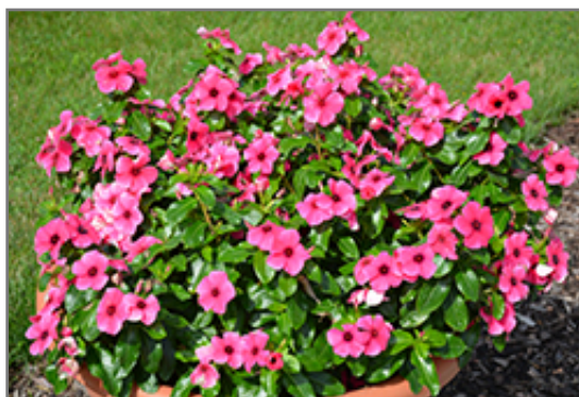
Tattoo Raspberry Vinca in bloom