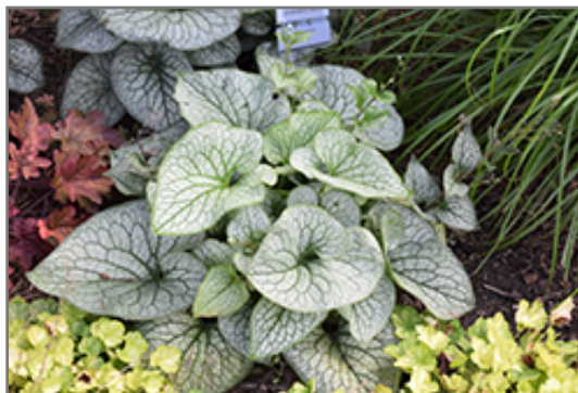
Queen of Hearts Bugloss foliage