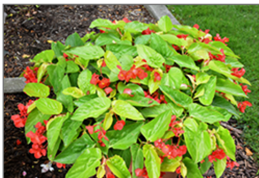
Canary Wings Begonia in bloom