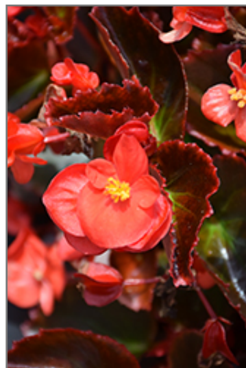
Senator IQ Scarlet flowers