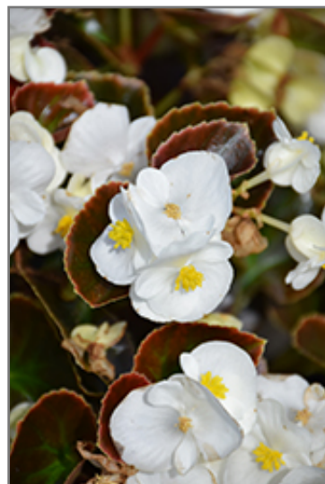
Senator IQ White flowers