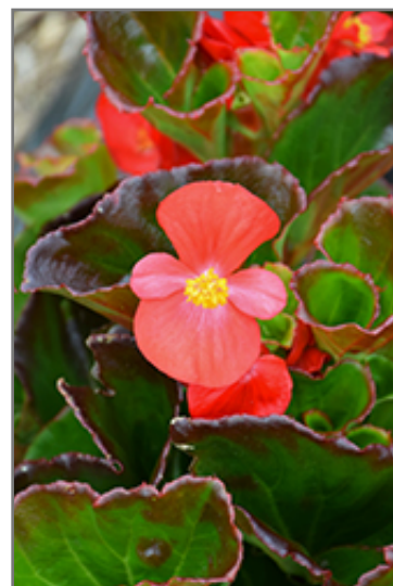
Tophat Scarlet Begonia flowers