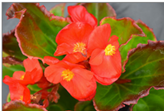
Tophat Scarlet Begonia flowers

Tophat Scarlet Begonia is recommended for the following landscape applications;