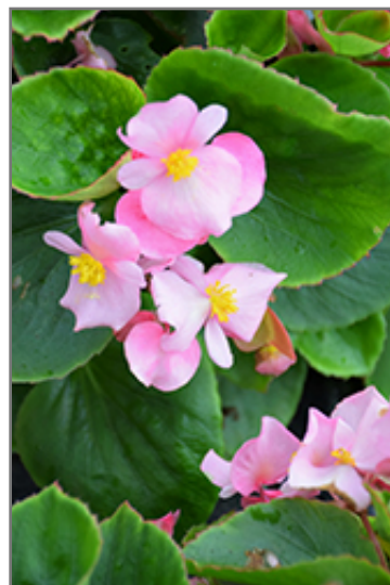
Topspin Pink Begonia flowers

Topspin Pink Begonia is recommended for the following landscape applications;