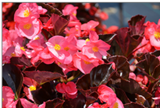
Viking Pink on Chocolate Begonia flowers

Viking Pink on Chocolate Begonia is recommended for the following landscape applications;