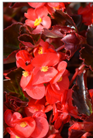
Viking Red on Chocolate Begonia flowers

Viking Red on Chocolate Begonia is recommended for the following landscape applications;