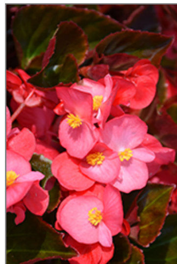
Viking Rose on Bronze Begonia flowers

Viking Rose on Bronze Begonia is recommended for the following landscape applications;