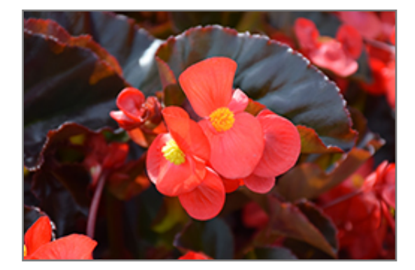
Viking XL Red on Chocolate Begonia flowers

Viking XL Red on Chocolate Begonia is recommended for the following landscape applications;