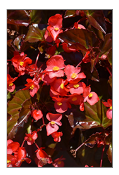
Viking XL Red on Chocolate Begonia flowers