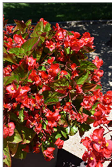
Viking XL Red on Green Begonia flowers