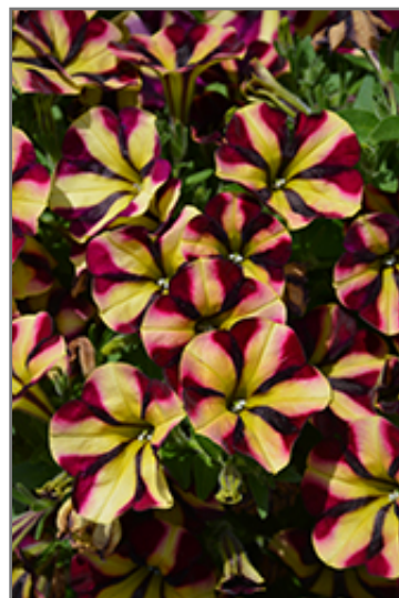
Amore Fiesta Petunia flowers

Amore Fiesta Petunia is recommended for the following landscape applications;