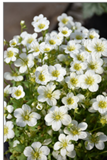
Touran Large White Saxifrage flowers

Touran Large White Saxifrage is recommended for the following landscape applications;