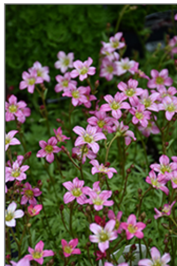
Touran Pink Saxifrage flowers

Touran Pink Saxifrage is recommended for the following landscape applications;