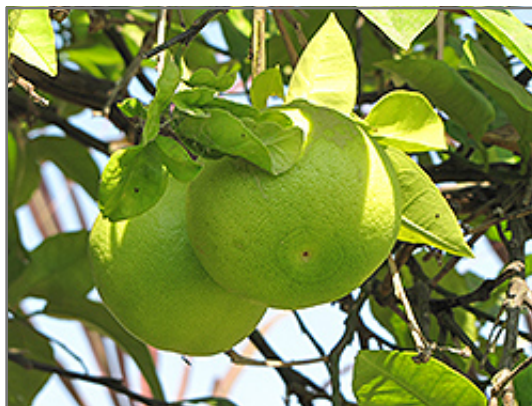
Oro Blanco Grapefruit fruit

A hybrid selection that is a cross between a sweet pummelo and white fleshed grapefruit; large, fragrant fruit with pale yellow flesh is sweet, juicy, and easy to peel; nearly seedless; a great orchard tree or landscape accent