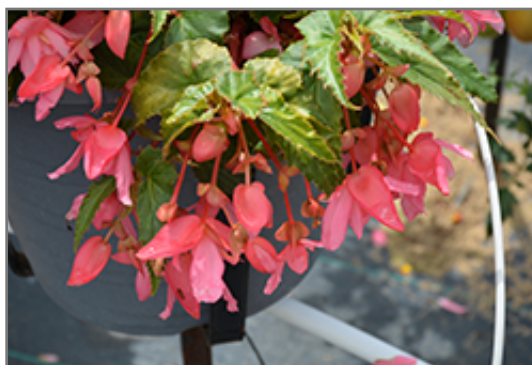
Funky Light Pink Begonia flowers