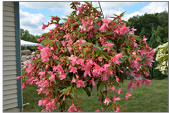
Funky Light Pink Begonia in bloom

Funky Light Pink Begonia is a fine choice for the garden, but it is also a good selection for planting in outdoor containers and hanging baskets. It is often used as a 'filler' in the 'spiller-thriller-filler' container combination, providing a mass of flowers and foliage against which the thriller plants stand out. Note that when growing plants in outdoor containers and baskets, they may require more frequent waterings than they would in the yard or garden.