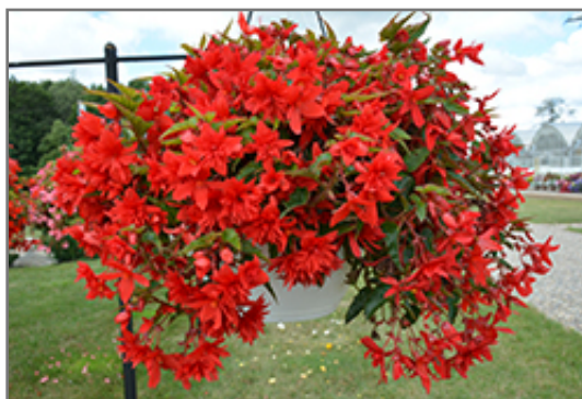
Funky Scarlet Begonia in bloom