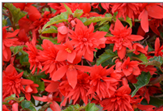
Funky Scarlet Begonia flowers

Funky Scarlet Begonia is recommended for the following landscape applications;