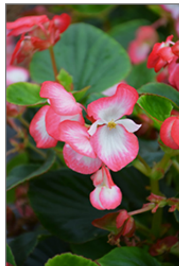
Volumia Rose Bicolor Begonia flowers

This is a high maintenance plant that will require regular care and upkeep, and usually looks its best without pruning, although it will tolerate pruning. Deer don't particularly care for this plant and will usually leave it alone in favor of tastier treats. Gardeners should be aware of the following characteristic(s) that may warrant special consideration;