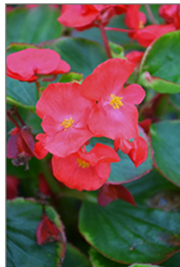
Volumia Scarlet Begonia flowers

Volumia Scarlet Begonia is recommended for the following landscape applications;