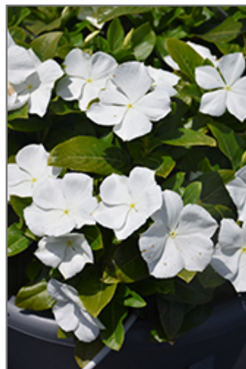
Cora XDR White flowers

Cora XDR White is recommended for the following landscape applications;