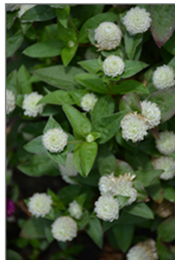
Ping Pong White Globe Amaranth flowers