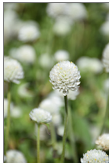
Ping Pong White Globe Amaranth flowers

Ping Pong White Globe Amaranth is recommended for the following landscape applications;