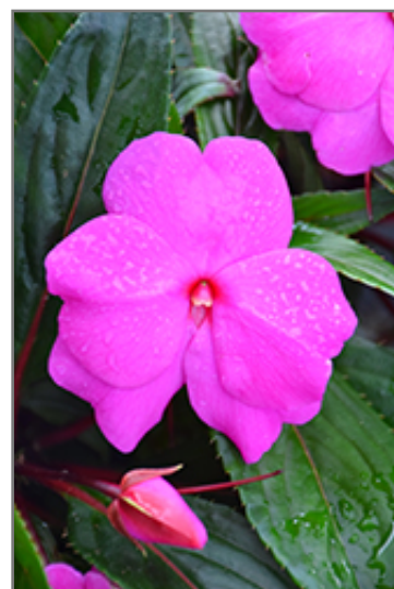
Sonic Amethyst New Guinea Impatiens flowers