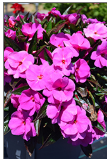
Sonic Amethyst New Guinea Impatiens flowers

Sonic Amethyst New Guinea Impatiens is recommended for the following landscape applications;