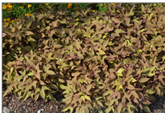
Sidekick Heart Bronze Sweet Potato Vine