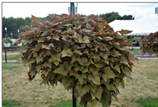
Sidekick Heart Bronze Sweet Potato Vine

Sidekick Heart Bronze Sweet Potato Vine is a fine choice for the garden, but it is also a good selection for planting in outdoor containers and hanging baskets. Because of its trailing habit of growth, it is ideally suited for use as a 'spiller' in the 'spiller-thriller-filler' container combination; plant it near the edges where it can spill gracefully over the pot. Note that when growing plants in outdoor containers and baskets, they may require more frequent waterings than they would in the yard or garden.