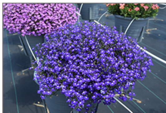
Techno Upright Cobalt Blue Lobelia in bloom