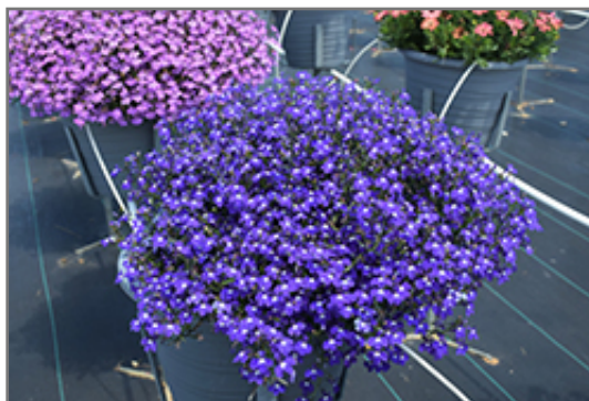
Techno Upright Cobalt Blue Lobelia in bloom