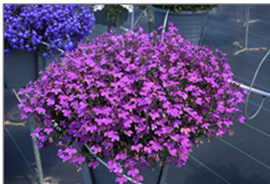
Techno Upright Purple Lobelia in bloom