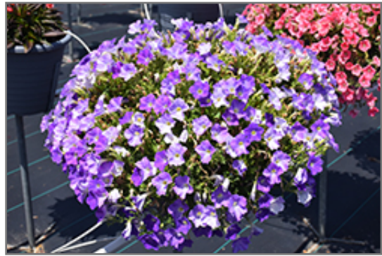
Dekko Sky Blue Petunia in bloom

Dekko Sky Blue Petunia is a fine choice for the garden, but it is also a good selection for planting in outdoor containers and hanging baskets. Because of its spreading habit of growth, it is ideally suited for use as a 'spiller' in the 'spiller-thriller-filler' container combination; plant it near the edges where it can spill gracefully over the pot. Note that when growing plants in outdoor containers and baskets, they may require more frequent waterings than they would in the yard or garden.