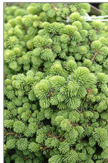
Little Gem Spruce foliage