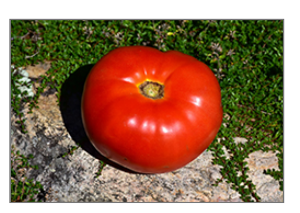
Mortgage Lifter Tomato fruit

Mortgage Lifter Tomato will grow to be about 4 feet tall at maturity, with a spread of 18 inches. When planted in rows, individual plants should be spaced approximately 24 inches apart. Because of its vigorous growth habit, it may require staking or supplemental support. This fast-growing vegetable plant is an annual, which means that it will grow for one season in your garden and then die after producing a crop.