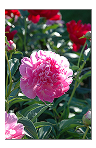
Bouquet Perfect Peony flowers

Bouquet Perfect Peony will grow to be about 24 inches tall at maturity, with a spread of 30 inches. When grown in masses or used as a bedding plant, individual plants should be spaced approximately 26 inches apart. The flower stalks can be weak and so it may require staking in exposed sites or excessively rich soils. It grows at a slow rate, and under ideal conditions can be expected to live for approximately 20 years. As an herbaceous perennial, this plant will usually die back to the crown each winter, and will regrow from the base each spring. Be careful not to disturb the crown in late winter when it may not be readily seen!