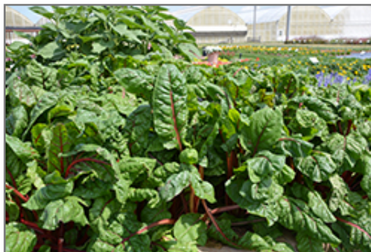
Ruby Red Swiss Chard