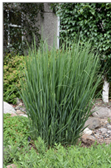
Northwind Switch Grass