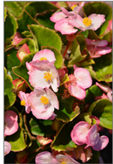
Sprint Plus Apple Blossom Begonia flowers

This is a high maintenance plant that will require regular care and upkeep, and usually looks its best without pruning, although it will tolerate pruning. Deer don't particularly care for this plant and will usually leave it alone in favor of tastier treats. Gardeners should be aware of the following characteristic(s) that may warrant special consideration;