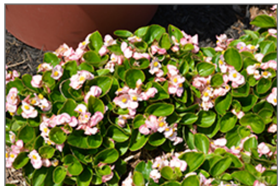
Sprint Plus Apple Blossom Begonia in bloom